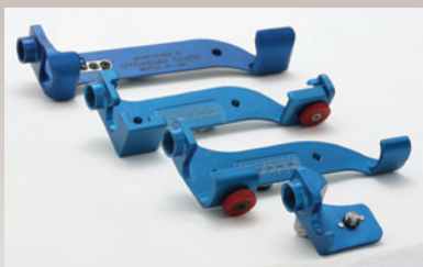
Four of Our Grips

Since 1993, Oppenheimer Camera Products has been producing the Oppenheimer Panhandle System. The first Oppenheimer Panhandle was developed to solve the problem of how to successfully mount a Preston Microforce onto the panhandle of a fluid head. Since we began this project, Oppenheimer Camera Products has introduced many other innovative products for film and video production including specialty lenses, the Spin Axis, on board battery systems, and monitor yoke mounts.